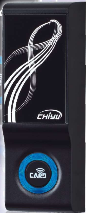
WR-E1/M1 (Black / Silver)