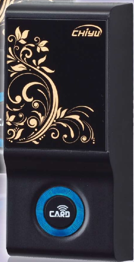
WR-E2/M2 (Black / Silver)